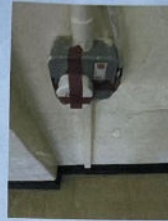
This is the plug for the screen